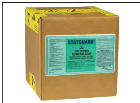
Figure 1. Statguard® Dissipative Neutral Floor Cleaner