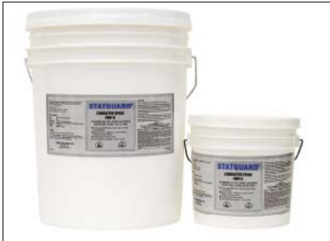
Figure 1. Statguard® Conductive Epoxy, Parts A and B