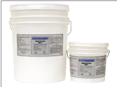
Figure 1. Statguard® Conductive Epoxy, Parts A and B